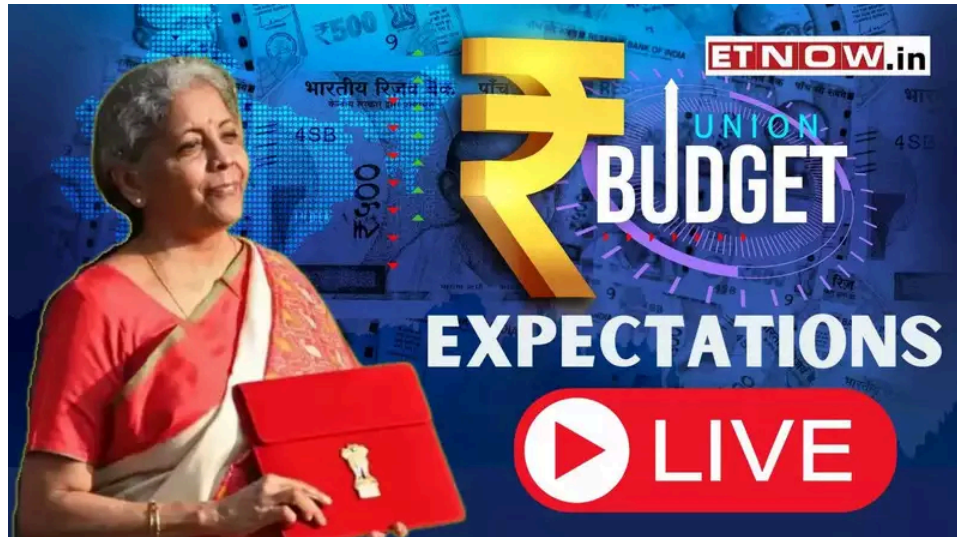
Budget 2024 Expectations LIVE Updates: What salaried employees, middle class tax payers expect from FM Nirmala Sitharaman in Union Budget 2024-25

Union Budget 2024 Expectations Live Updates: Union Finance Minister Nirmala Sitharaman is scheduled to present the Budget for 2024-25 in the Lok Sabha on July 23. Notably, the Budget session of Parliament begins July 22 and will end on August 12. This will be the first budget of the new Modi government after the Lok Sabha elections. This will be Nirmala Sitharaman's 7th Budget since she took over as the Finance Minister of India in 2019. Expectations are running high this time as people are expecting relief in personal tax rates from the government. Meanwhile, the budget is being looked at to bring relief to salaried employees, middle class taxpayers and also the common man. Besides, several sectors including infrastructure, agriculture, real estate, finance, fintech, online gaming, and AI are optimistic about the Budget 2024.